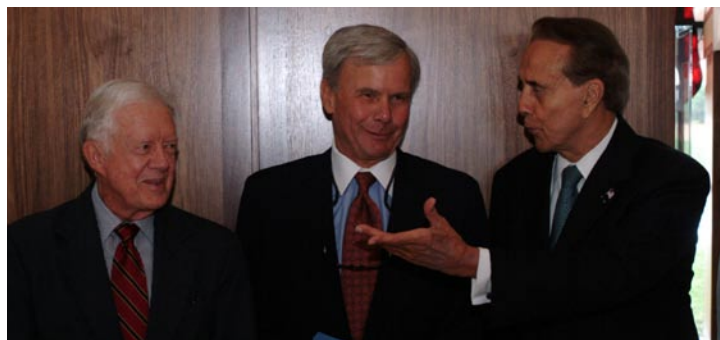
Since its inception, the Dole Institute has brought world leaders to the heartland to discuss the most important events of our day. Top to bottom: Lech Walesa, 2005 Recipient of the Dole Leadership Prize, a Nobel Peace Prize Laureate, and former President of Poland; Rudolph Giuliani, former Mayor of New York City, with Senator Dole; General David Petraeus visiting the Institute; Former Secretary of State Madeleine Albright; and President Jimmy Carter with Tom Brokaw and Senator Dole. The next page features Senator Tom Daschle, former senate Democratic leader and KU Students.