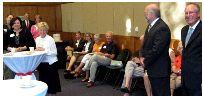
PRIOR TO THE PROGRAM, THE TWO ADVOCATES MET WITH MEMBERS OF THE FRIENDS OF THE DOLE INSTITUTE.