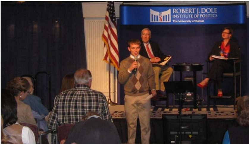
THE EVENING'S HEALTH CARE DISCUSSION DREW A FULL HOUSE FROM THE CAMPUS AND COMMUNITY.